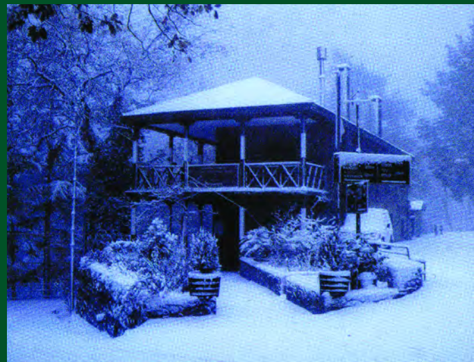
Stavros tis Psokas forest station in the winter

The trail follows an uphill route ascending on the Chorterí peak, 1290m above sea level and walking is rather difficult. Afterwards descends down to the start. At some points of the route there are excellent views to the Stavros Valley and other parts of the Pafos forest. The trail offers also the opportunity to observe, study and photograph the local flora, fauna and geology.