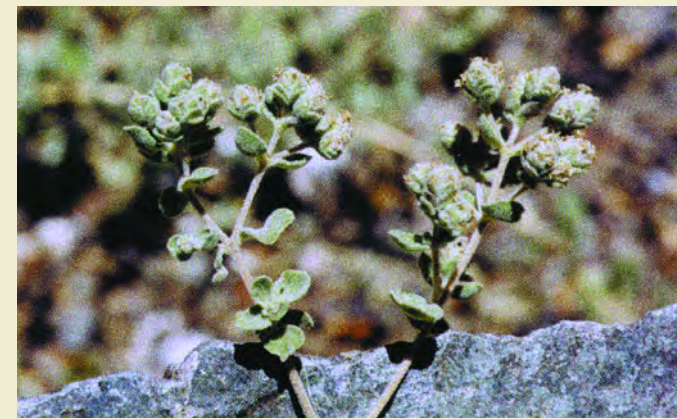
Origanum dubium , Origane

producing tree on the island. The cancer on its wood indicates abnormally rapid growth of woody tissues caused by a pathogenic agent. This kind of cancer is rarely fatal to trees.