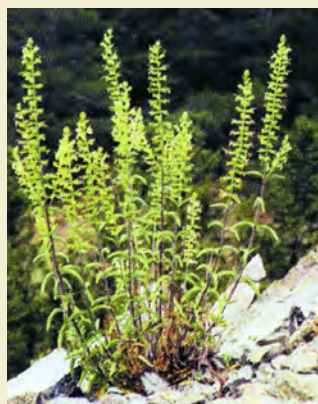
Teucrium kotchyanum , Kotchy's Germander

29. Teucrium kotchyanum , Kotchy's Germander: Common perennial plant (alt. 500 - 1 500 m).