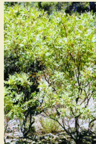
Rhus coriaria , Sumach