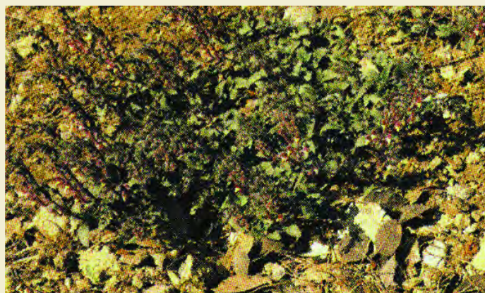
Scutellaria cypria , Cyprus Scull-cup

28. Scutellaria cypria , Cyprus Scull-cup: Endemic perennial plant, common in altitudes 400 - 1 950 m. It flowers from April to June.