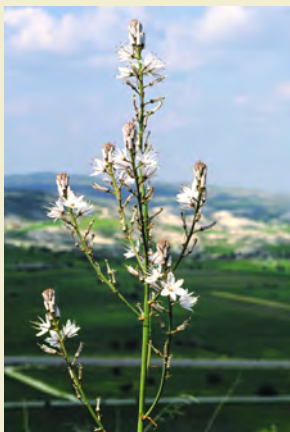
Asphodelus aestivus , Asphodel

27. Asphodelus aestivus , Asphodel: Mediterranean perennial herb, particularly common in grazed areas (alt 0 - 1 800 m).